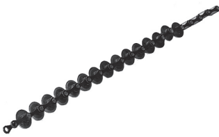
Multi-roller cutting chain