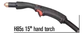
H85s 15° hand torch