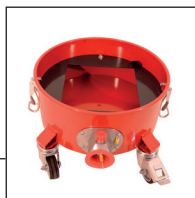
15ltr detachable container.