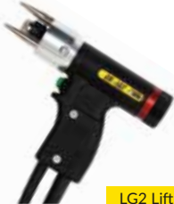
LG2 Lift Gap