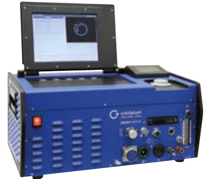
OM 165CA Orbital Welding Power Supply