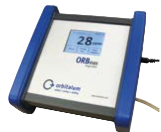
ORBmax Digital Oxygen Analyzer for superior weld quality