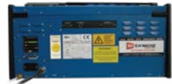
Easily connect external monitor, keyboard, and printer