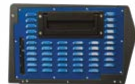
Integrated lifting handles and compact design for enhanced portability