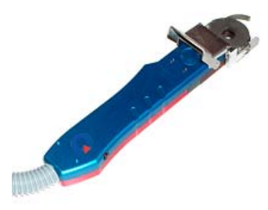
UHP 500-2 with clamping cassette