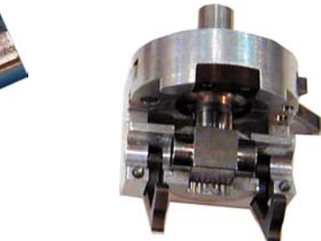
Fixture-Block for UHP 500-2