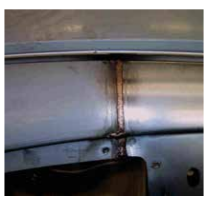
MIG welding or MIG brazing