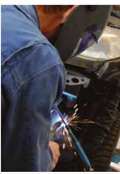
MIG brazing maintains the strength of the steel and protects the anti-corrosive zinc surface