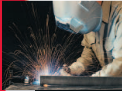
Conventional CV short circuit transfer using CO 2 and .045" solid wire.

Unlike standard CV GMAW machines, the STT® machine has no voltage control knob. STT® uses current controls to adjust the heat independent of wire feed speed, so changes in electrode extension do not affect heat. The STT® process makes welds that require low heat input much easier without overheating or burning through, and distortion is minimized. Spatter and fumes are reduced because the electrode is not overheated—even with larger diameter wires and 100% CO 2 shielding gas. This gas and wire combination lowers consumable costs.