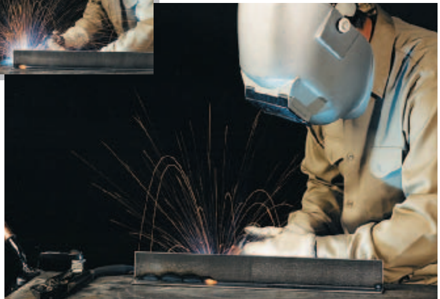
STT® using CO 2 and .045" solid wire.