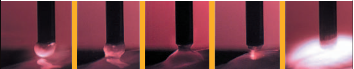
A. STT® produces a uniform molten ball and maintains it until the "ball" shorts to the puddle.