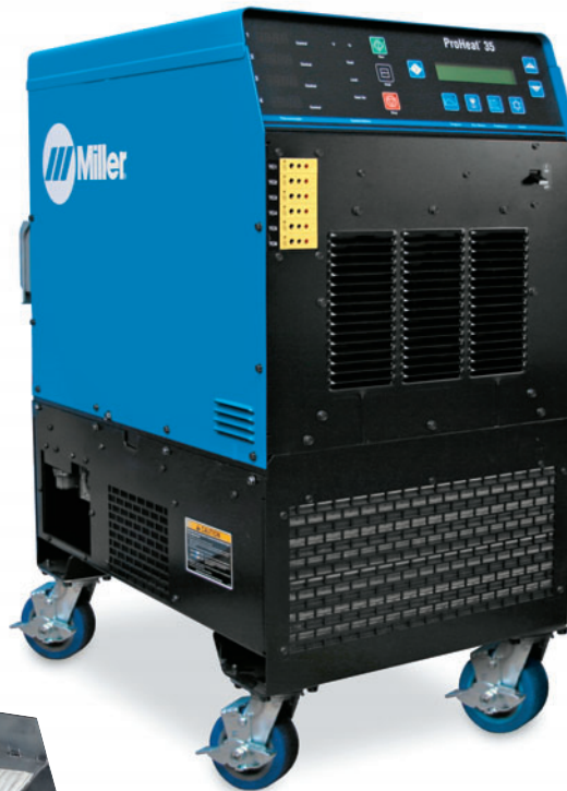
ProHeat 35 power source shown with heavy-duty induction cooler (951686) and optional running gear (195436).