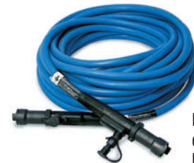
ProHeat liquid-cooled induction heating cable.

Improved working environment is created during welding. Welders are not exposed to open flame, explosive gases and hot elements associated with fuel gas heating and resistance heating.