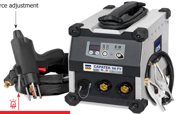
Gun assembly w/ LED light