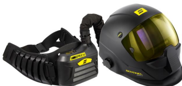
EPR-X1.1 with Sentinel A60 Air Helmet