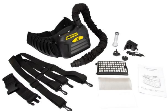
EPR-X1.1 PAPR System