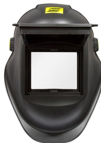
Internal viewing visor