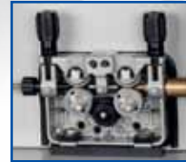
Polyfil-3 drive mechanism