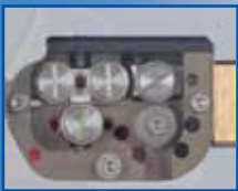
Polyfil Compact drive mechanism with wire straightening system