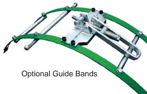
Optional Guide Bands