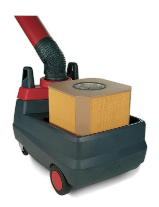
Filter shown inside Mobiflex® 200-M