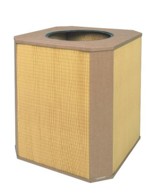
Mobiflex® 200-M Filter