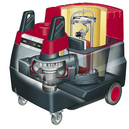
Internal view of Mobiflex® 400-MS showing self-cleaning filter mechanism.