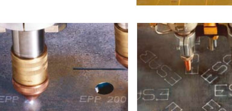
Plasma cutting and marking with the same torch