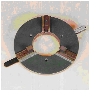
WP Range (see above chart)

WP Range Self Centring Gripper Chucks are available in 3 diameter ranges WP-200, WP-300 & WP-400. They are ideal for use for welding and providing higher levels of efficiency and versatility in operations involving welding of fittings, flanges, etc.