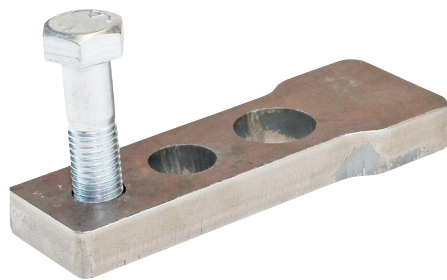
With True Hole technology

True Hole®, part of Hypertherm's SureCut™ technology was launched in 2008 with the HPRXD® autogas family of products. It is now also offered on Hypertherm's XPR™ systems. TrueHole for mild steel produces significantly better hole quality than what has been previously possible using plasma. Equally important, True Hole technology is delivered automatically without operator intervention, to produce unmatched hole quality.